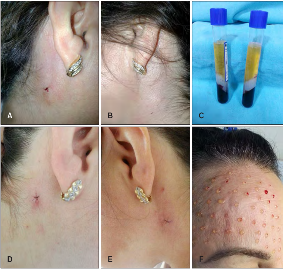
Fig. 1. The first biopsy was obtained from the right infra-auricular area before treatment (A). Saline was injected to the left infra-auricular area (B). Platelet-rich plasma (PRP) (C) was injected to the upper site of this right infra-auricular area (A) and face (F). On day 28 after PRP and saline injections, punch biopsy was performed on PRP (C) injected to the upper site of this right infra-auricular area (D) and control (saline injected area) site (E).