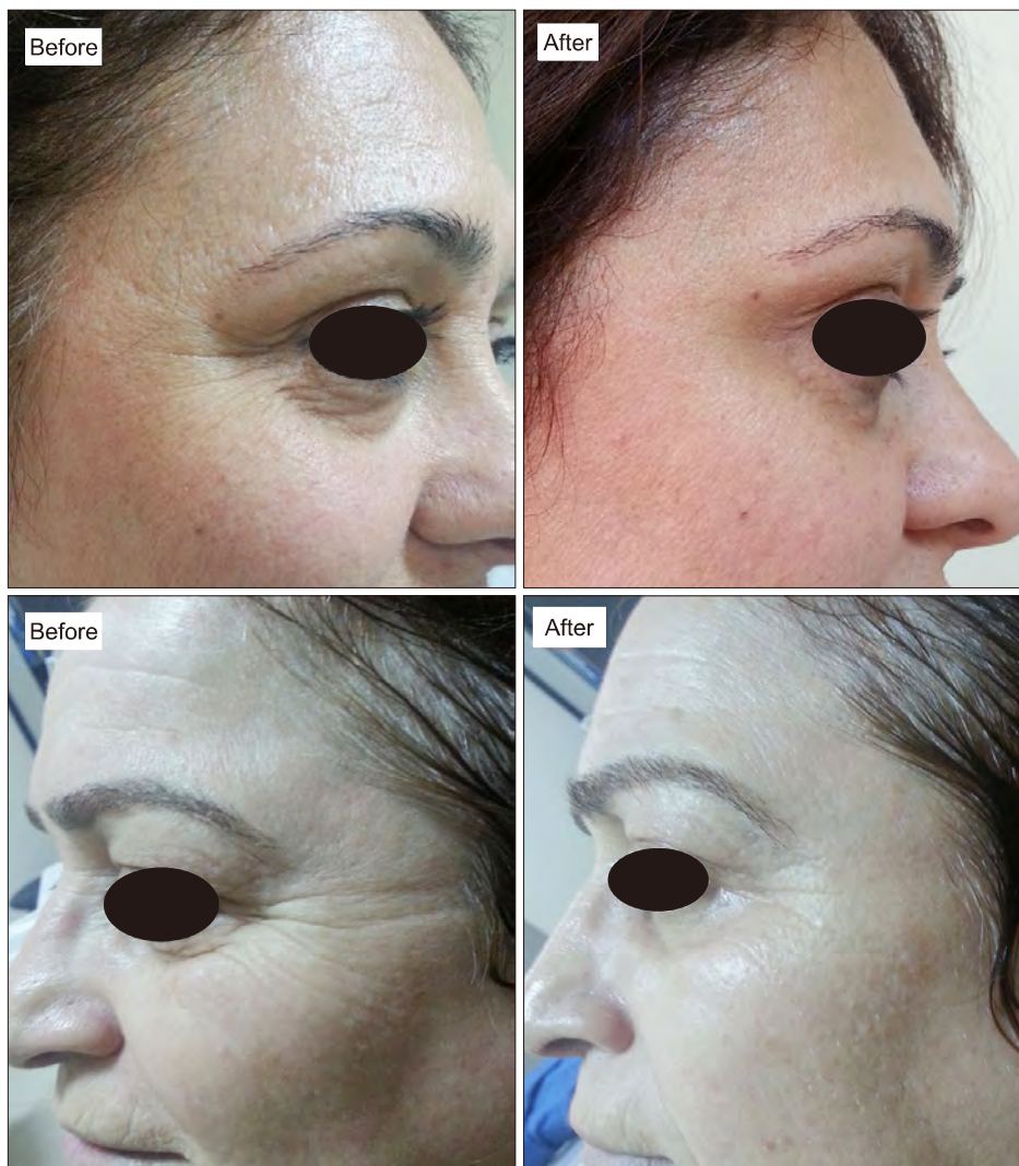
Fig. 3. Periorbital wrinkles before platelet-rich plasma (PRP) treatment and clinical improvement of periorbital wrinkles after PRP treatment.

Masson's trichrome stain results of the skin samples (control vs. saline vs. PRP injection site) were represented